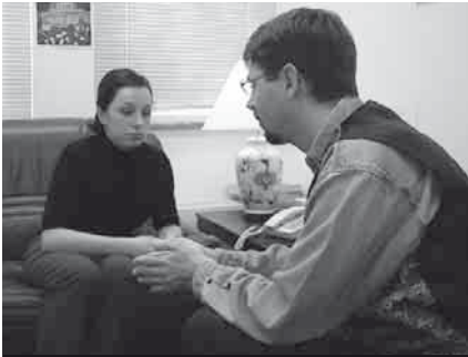
Resources like Jeffery Hale Community Services can help