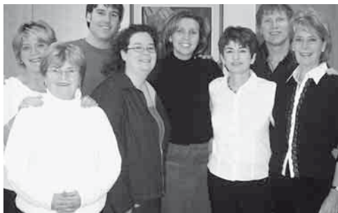
A variety of services and activities to brighten your world